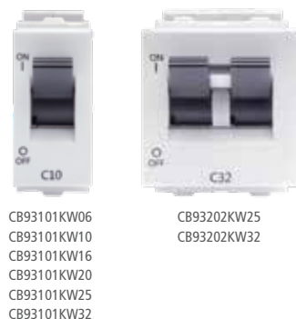
CB93101KW06 CB93101KW10 CB93101KW16 CB93101KW20 CB93101KW25 CB93101KW32